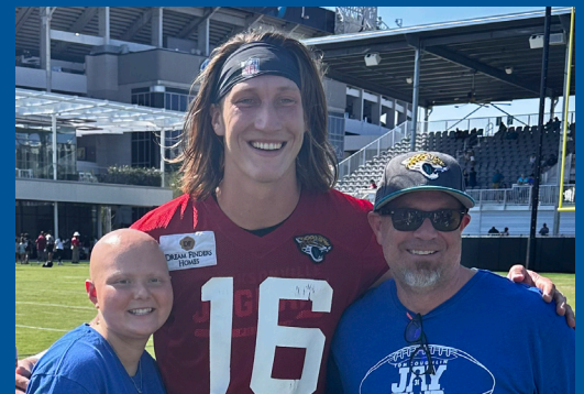
Jaguars Training Camp