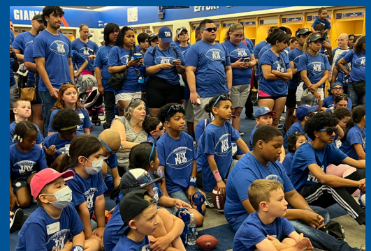
Giants Sundae Blitz