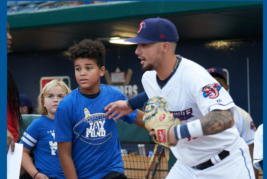
Jumbo Shrimp Baseball Game