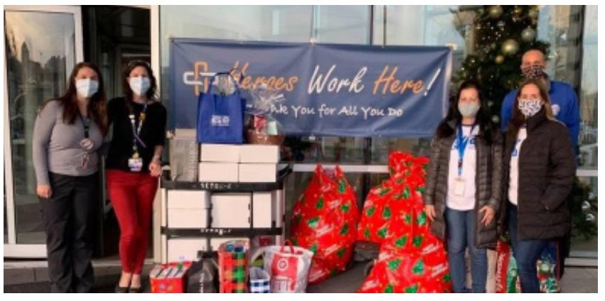
Grover Cleveland Middle School dropping off holiday presents and packages to St. Joseph's Health in Paterson, NJ