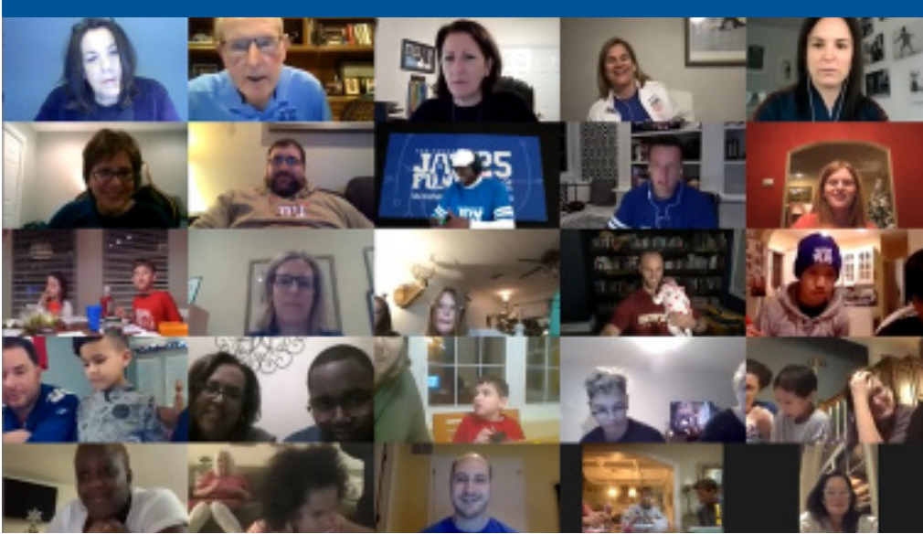
Virtual Celebrity Bingo for patients and their families